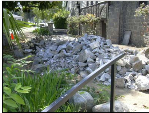
Above: Day 2 Below: Sewer Project

Please be careful as you walk around the construction area, we do not want any accidents. Thanks.