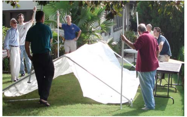
Pictured on the right is the Men's Breakfast work party setting up for the Ministry Fair.

Our vision is that the Church of the Ascension serves Christ today for those who will come to know Christ tomorrow.