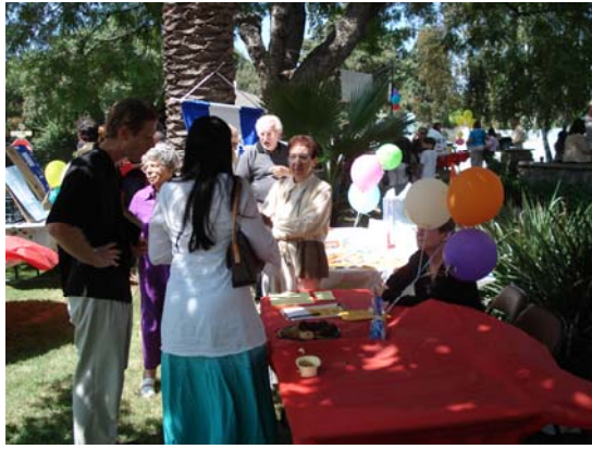
Pictured on the left is the crowd enjoying the Ministry Fair September 10.