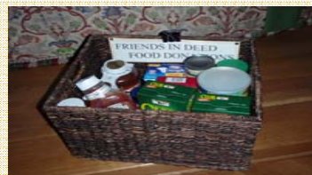
Items such as peanut butter, canned meats, and fish are most needed.

How can we respond? We can help if whenever we go to the grocery store we pick up items for the Friends In Deed Food Pantry, the food distribution branch of the Ecumenical Council of Pasadena Area Churches and bring these items to church on Ingathering Sunday. If each family at Ascension would bring one item, WE can make a significant difference in the lives of others.