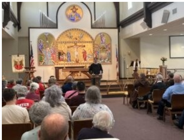
Rooted and Growing Evangelism workshop at the Fearless Faith Revival.

What if we practiced our faith boldly? There's no reason not to invite people to our churches. There's often more money available than we think. Even if some new ministry doesn't take off, we will learn something—so there's rarely a total failure. Fearless faith is closer to the adventure that the Gospels suggest when we choose to follow Jesus.